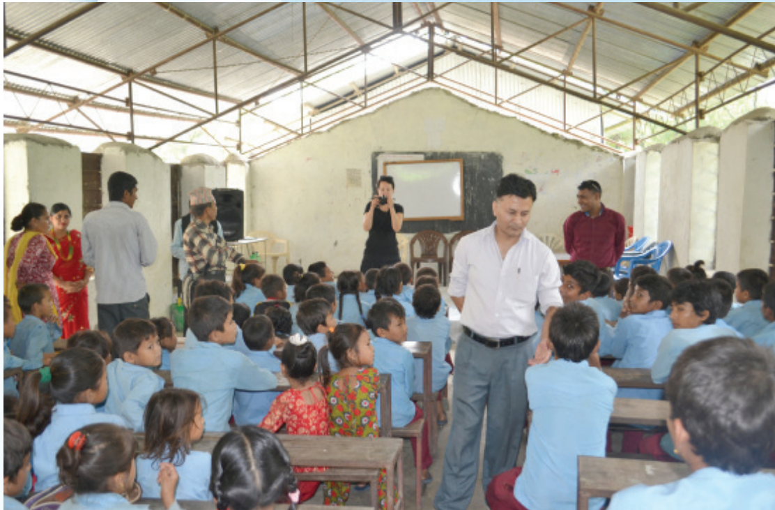
Monitoring team is interacting with School students of Bal Manorama Basic School, Ashrang, Lalitpur