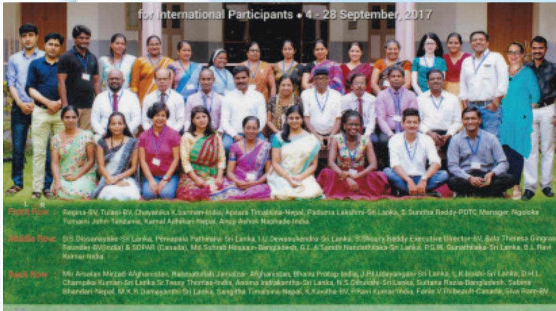
Participants group photo of International training on Community Driven Development organized by Bala Vikasa, Warangal, India