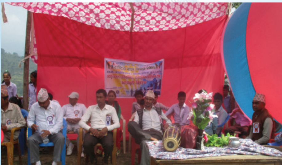
Local bodies gather on the eve of National Children Day, Dadeldhura

Dadeldhura, on September 14, 2017 National Children day was celebrated with the coordination of Women and Child Development office Dadeldhura, District Education office and Loo Niva child concern group The Rural Municipality Ajamaru ward