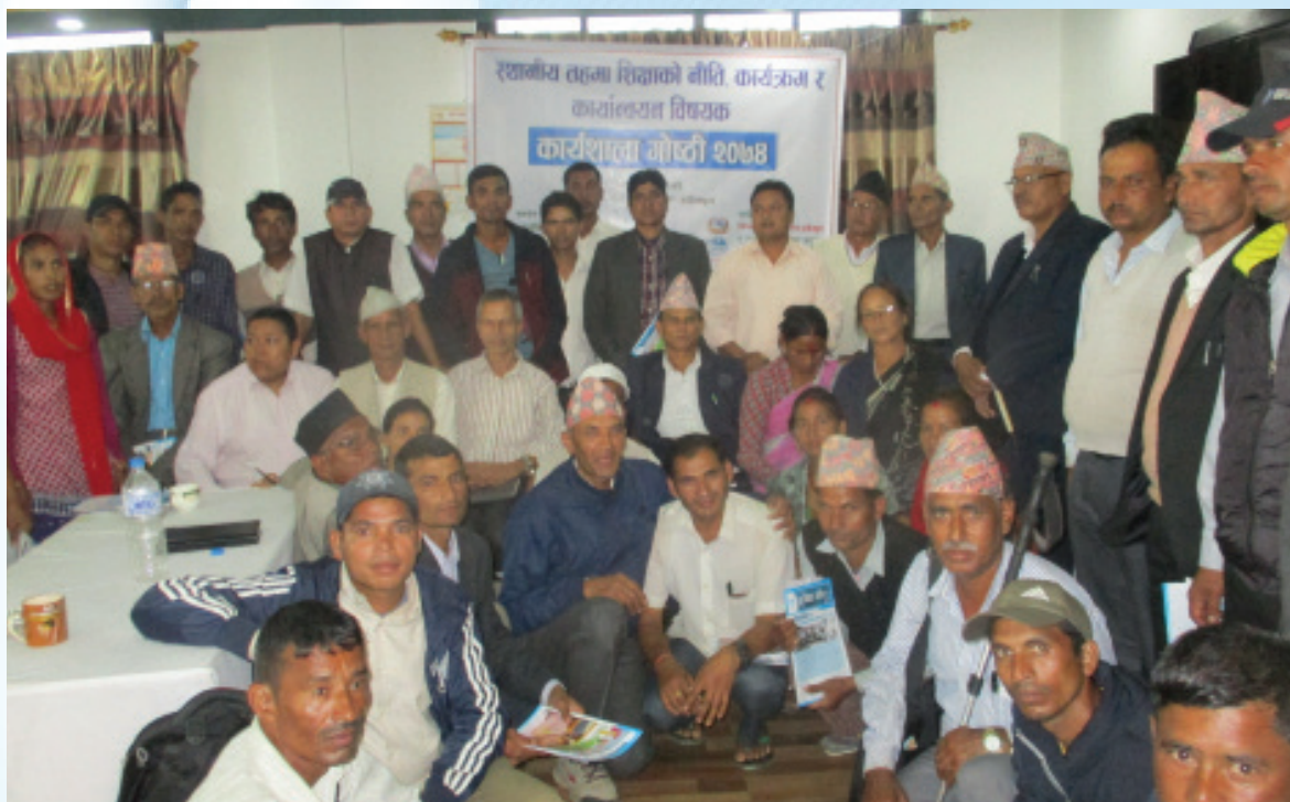
Group Photo of Participants in Local Level Education Program, Dadeldhura

Dadeldhura , 6th October 2017, District Education Office, Dadeldhura and Loo Niva Child Concern Group jointly organized a one day workshop on local level education policy at Hotel Syaubari View Tower. Program was opened by Chief guest of District Coordination Committee's Chief, Dadeldhura. Program