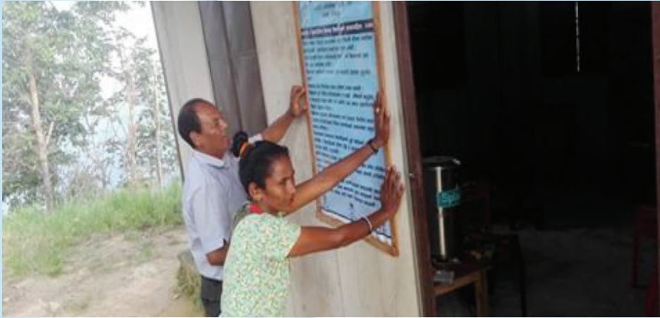
Display of code of conduct by Bal Bhairab Primary school head teacher , Gimdee- Lalitpur

Lalitpur , On the support of Loo Niva Gimdee, Ashrang, Thuladurlung VDC 's 18 schools prepared and have displayed code of conduct in different public spaces of school area. The main objective to makes school management and other committee bodies more responsible, accountable and transparent