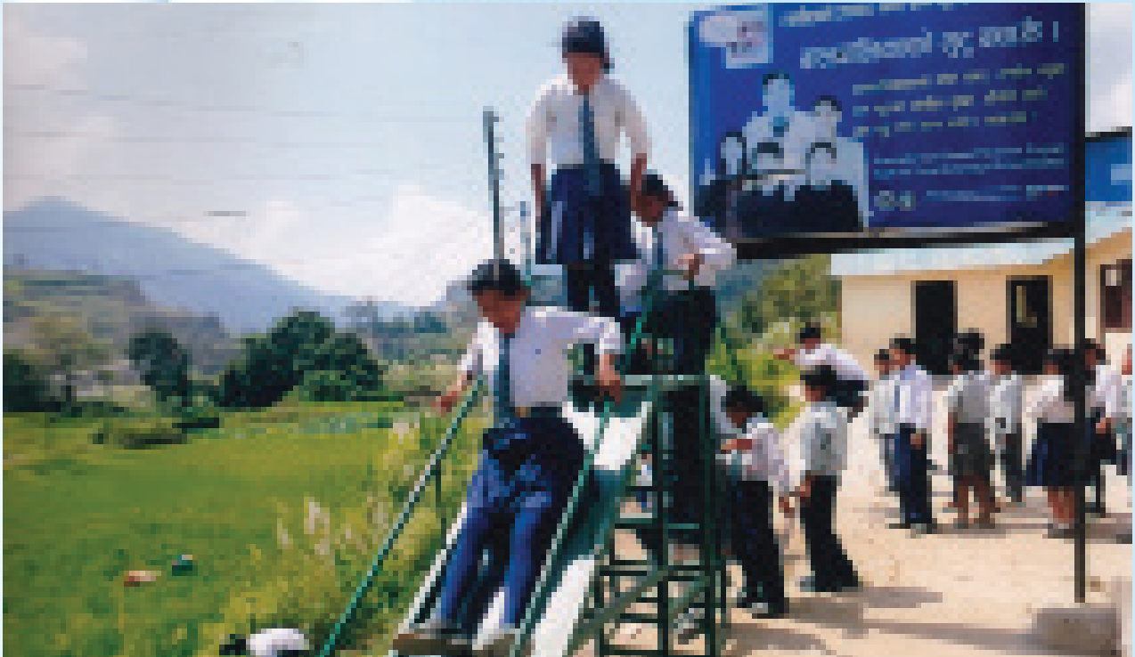
Students of Bakhel Kumari Basic School's students enjoying game supported by Loo Niva, Lalitpur

Lalitpur, Loo Niva provided games materials, two swing one for boys and girls each and cute to Bakhel kumari school through school support program.