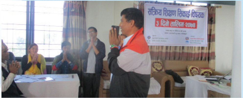
Participants giving introduction during the session, Dadeldhura

There were 2 participants from each 4 model schools, 20 participants from schools and one each participant from Primary schools, altogether 38 were participated on the training. To deliver the effectively on class by teachers and use child friendly environment at school was the