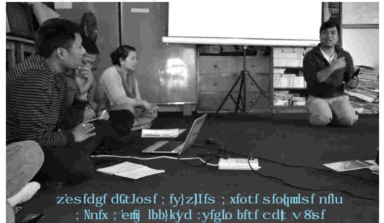
z'esfdgf dGJosf ; fy}z]fš ; xofu sfoqmdsf nflu ; Nfx ; 'erj lbb]kyd :yflgo bftf cd{ v8šf

; xofuLbftf?dW]1fgb]dxhgn]z'esfdgf dGJosf ; fy} c]fosf]sf]klg :ykgf ug{kg}; Nfx lbg'ePsf]lyof]. klxf] :yflgo ; xofuLbftf cd{ v8šfn]; xofuLbftf? j ]4 ug{ :j od\cfkm]klg kxn ug{tof/ /xšf]s'/fsf]hfgsf/L lbg'eof]. ; fy}pxff]ojf :j od\;js kl/rfng dkku cfj Zostf klxfg ug{kg}; 'erj lbg'ePsf]lyof]. To:t); xofuLbftf ; fu/ thfw/n]:yflgo tyf ; /sf/Lgsfo; f ; dGJo u/Lsfo]gfos gu/kfnsfnf0; kltzt lj Bfno egf{ePsf]gu/sf]; kdf 3f]f0f ug{kg}; 'erj lbg'eof].