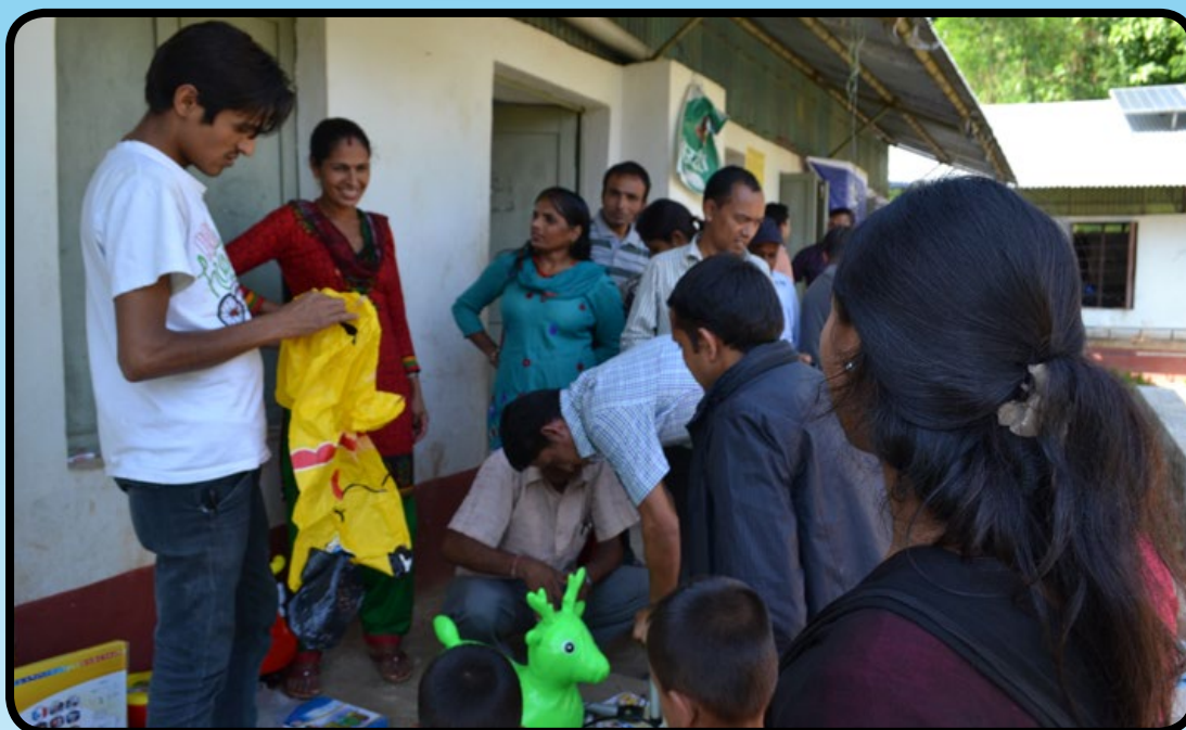
Loo Niva Social Mobilizers giving instruction to the teacher on using materials

Lalitpur , Different game materials related to the psychological development distributed for primary level students of 28 schools. The aim of the distribution is to reduce psychosocial problems through different entertaining activities. The program has also supported to the schools who lost games materials during earthquake.