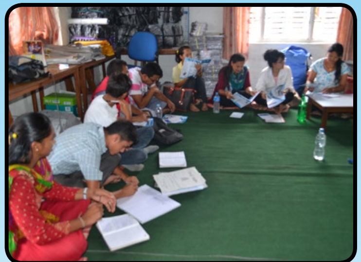
Youth volunteers discussing with each other at meeting

developed implementation plan for three months.