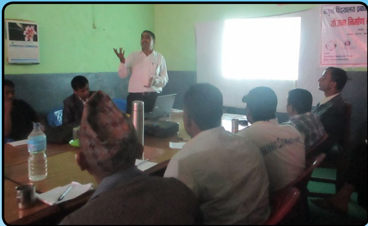
DEO of Dadeldhura giving speech in the program

Dadeldhura , Loo Niva organized model school promoting orientation and planning workshop on 2nd October to develop at list one model school in each project VDC. 46 participants from different schools, government and non-governmental organization took part in the program. Nawadurga