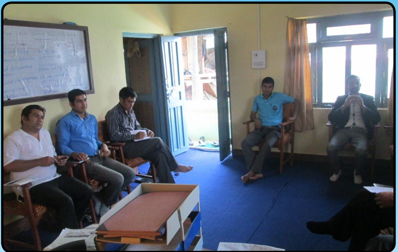
Loo Niva staff and other concern person at the meeting

Dadeldhura , Two community radio; Radio Amargadhi and Radio Sudur Aawaj broadcasted 12 episodes of concern for education program coordinating with District Education Office, Dadeldhura. The radio