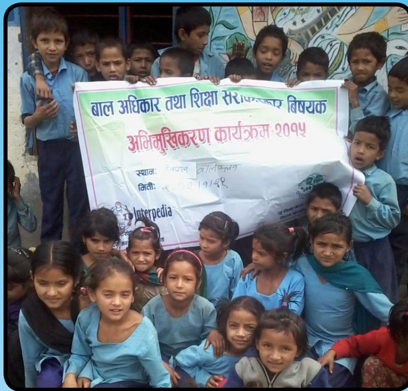
Children are in group picture after child club orientation program

Lalitpur , 636 child club members of 19 school based child club members from Khokana, Bungamati, Dukuchhap, Ashrang, Gimdi and Thuladurlung oriented on resiliency during September and October months. The main objective of the orientation was to develop capacity and skills of children after earthquake and support them to bounce back to the normal life. The program supported children to be aware on their own capacity. Similarly, orientation