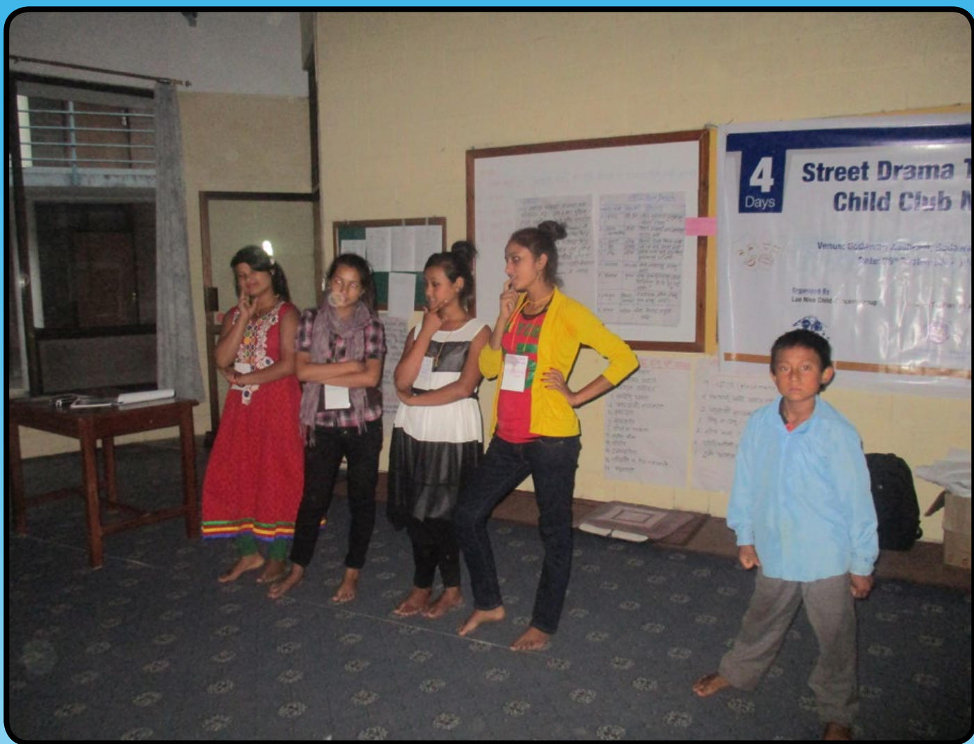
Children are showing Drama after completing training