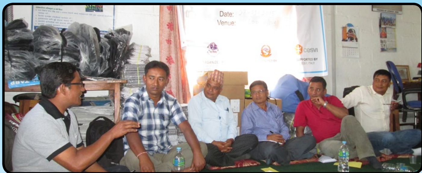
Teacher expressing his opinion in the orientation